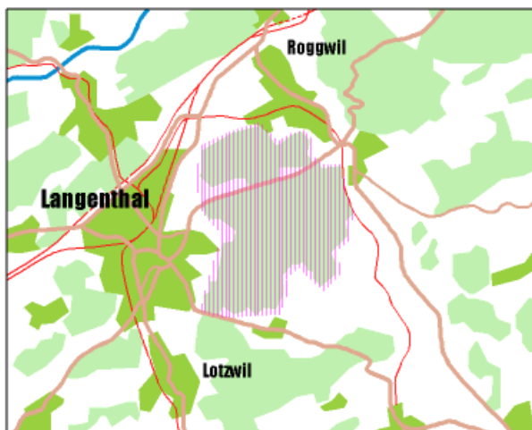
Relay, map: "Langenthal Ost"