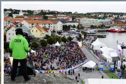
TV coverage from the Sprint in Strömstad